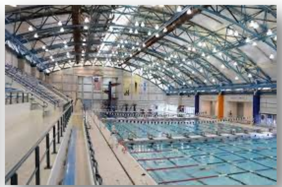
Nassau Aquatic Center